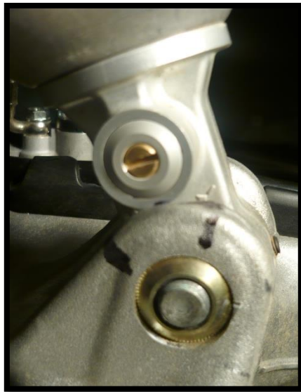
REMOVE SPRING. ROTATE SWINGARM. MARK SHOCK FOR MOVEMENT LOCATION