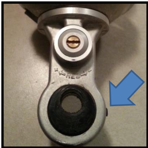
REMOVE HEIM JOINT, INSTALL SYNERGY X-BUSHING DRILL AND TAP M5 X 0.8 THRU SHOCK BODY, INDENT BUSHING. SET SCREW WILL LOCK ONTO X-BUSHING