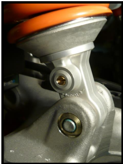
REFERENCE: STOCK SETUP